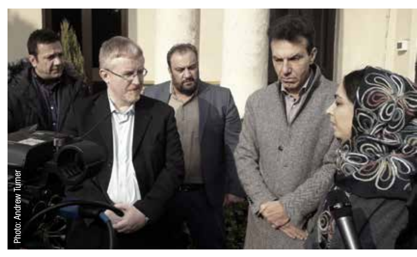
Presentation of flowers and condolences to Canada outside the Italian embassy in Tehran

"Almost immediately, Minister Champagne reached out to his Italian counterpart and I reached out to mine, because we knew