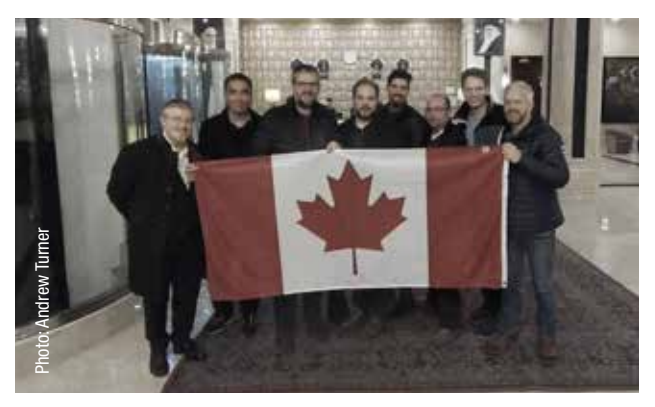
SRDT in hotel lobby immediately before departing Iran