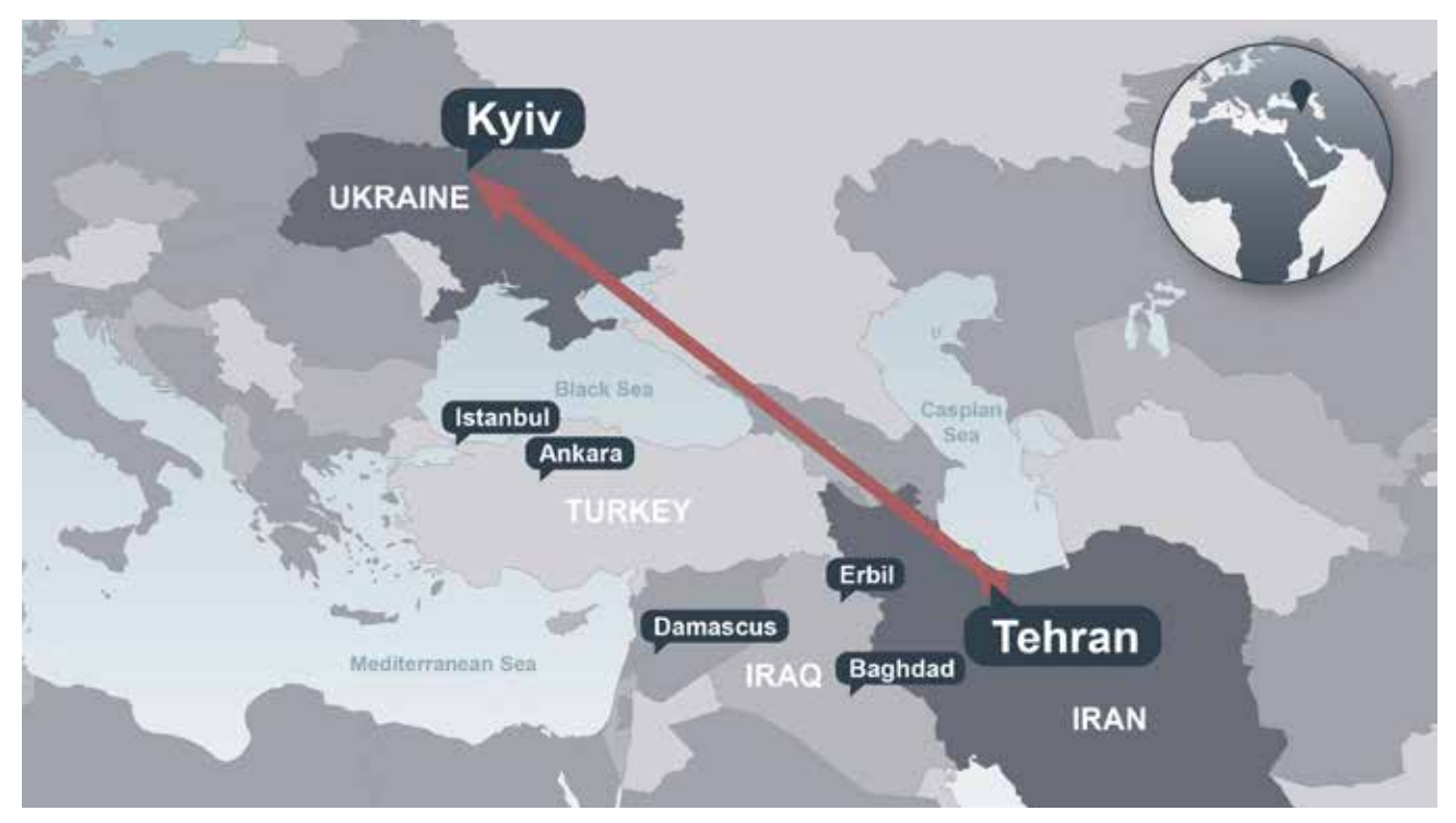
A depiction of where PS752 was headed from Tehran to Kyiv on January 8, 2020.