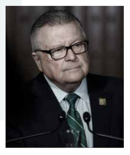
THE HONOURABLE RALPH GOODALE