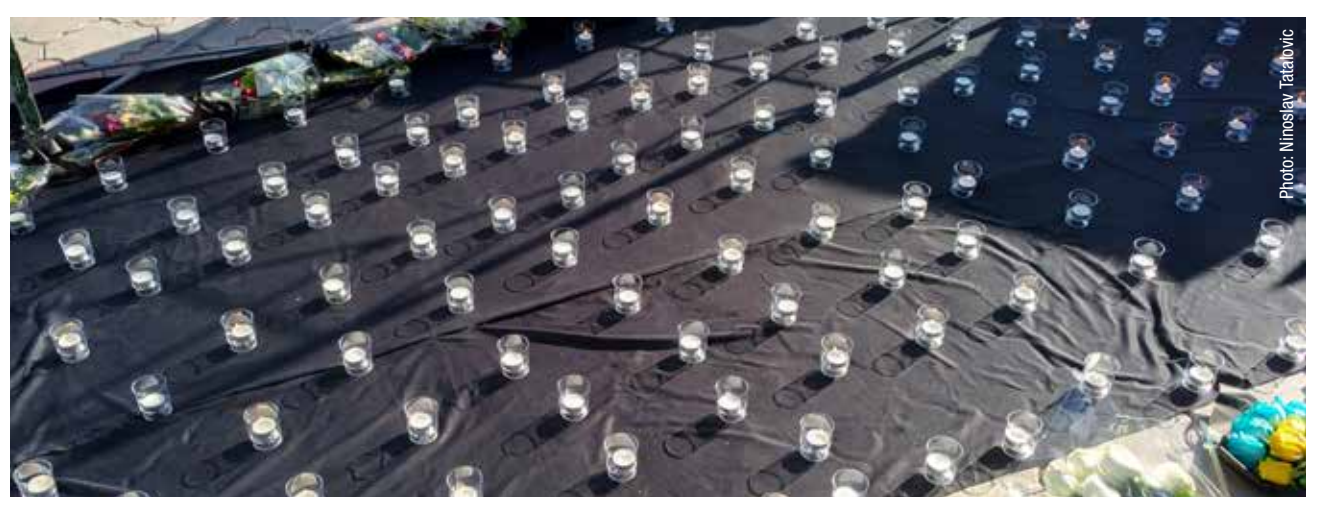
Memorial at the PS752 crash site