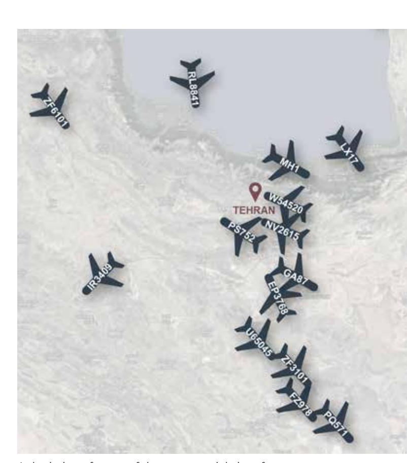
A depiction of some of the commercial aircraft over northern Iran at about the time PS752 was destroyed

This realization began a process that would later evolve into the Safer Skies Strategy, designed to bring willing partners together to establish a common set of practices to better protect passengers from the risk of flying in or near foreign conflict zones.<sup>3</sup>