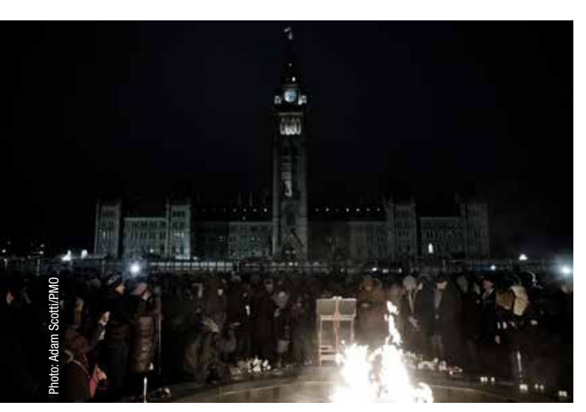
A vigil on Parliament Hill

Minister Champagne discusses PS752 with Iranian Foreign Minister Zarif, calling on Iran to send the PS752 flight recorders to France for analysis without further delay