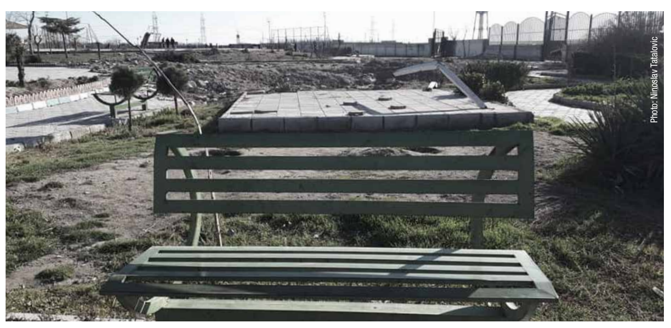
PS752 crash site