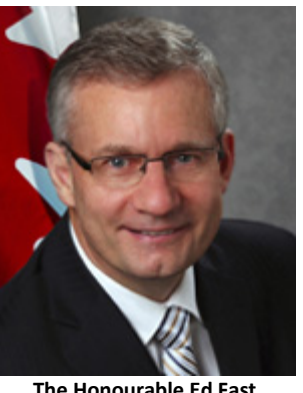
The Honourable Ed Fast Minister of International Trade