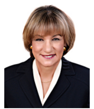
The Honourable Lynne Yelich Minister of State (Foreign Affairs and Consular)

We are pleased to present the 2014-15 Report on Plans and Priorities, the first report for Foreign Affairs, Trade and Development Canada (DFATD). Building on the strong foundation of Canada's international engagement, the consolidation of our foreign policy, trade and development functions into a new department presents exciting opportunities to serve Canadians, promote our values and interests, solve global challenges and bring prosperity to Canada and the world.