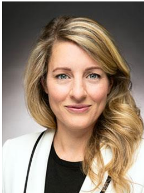
The Honourable Mélanie Joly Minister of Foreign Affairs