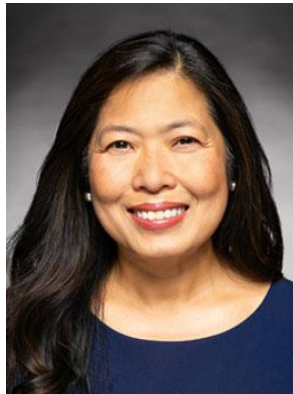
The Honourable Mary Ng Minister of International Trade, Export Promotion, Small Business and Economic Development