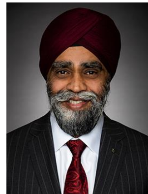
The Honourable Harjit S. Sajjan Minister of International Development

In a time of complex and volatile geopolitics and shifting power, Canada must remain a leader in protecting peace and security and supporting multilateral institutions and the rules-based international system.