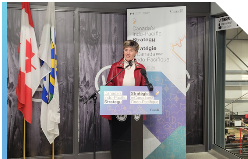
Minister Bibeau announcing location of the Indo-Pacific Agriculture and Agri-Food Office, December 2022