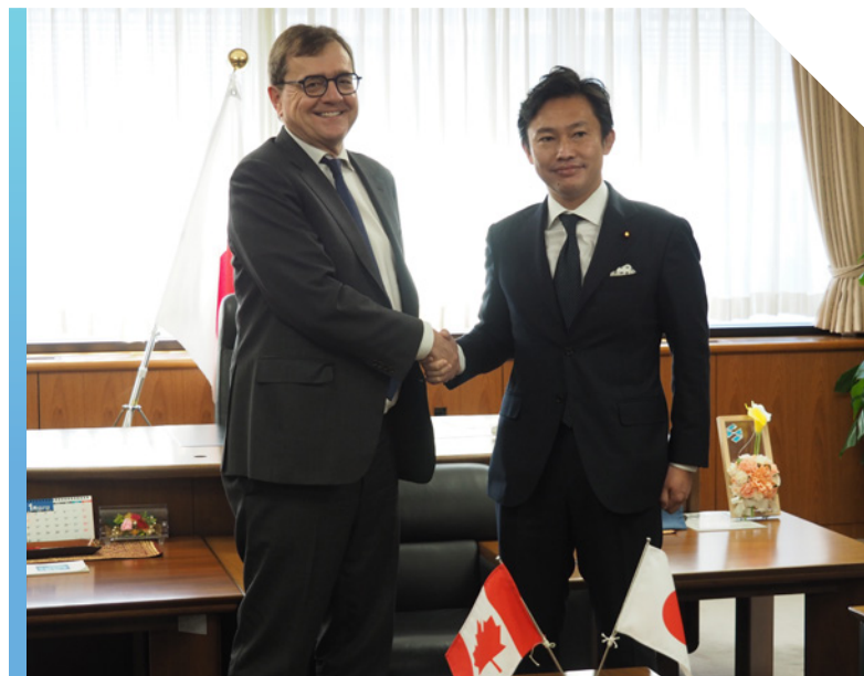
Minister of Energy and Natural Resources Jonathan Wilkinson meeting his Japanese counterpart, January 2023