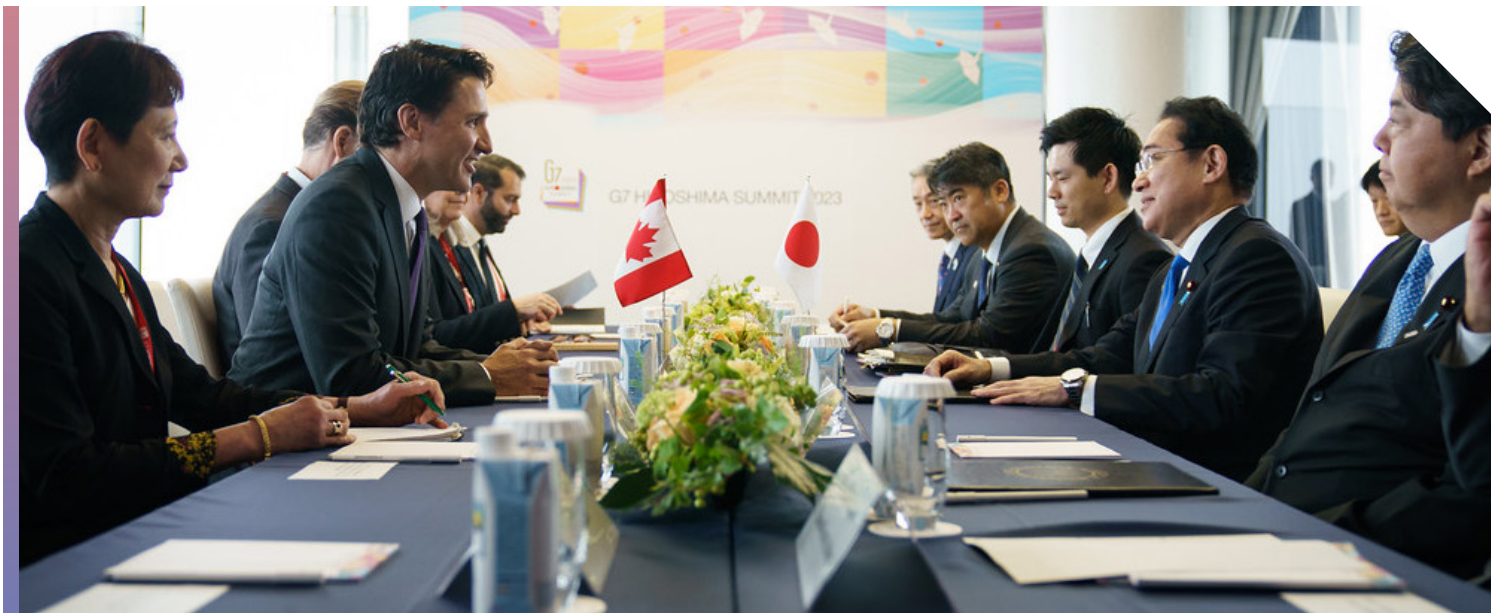
Prime Minister Trudeau at the 2023 G7 Summit in Hiroshima, Japan