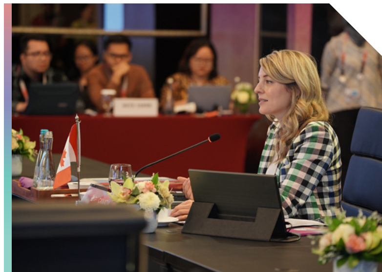
Minister Joly at the 2023 ASEAN Post-Ministerial Conference in Jakarta