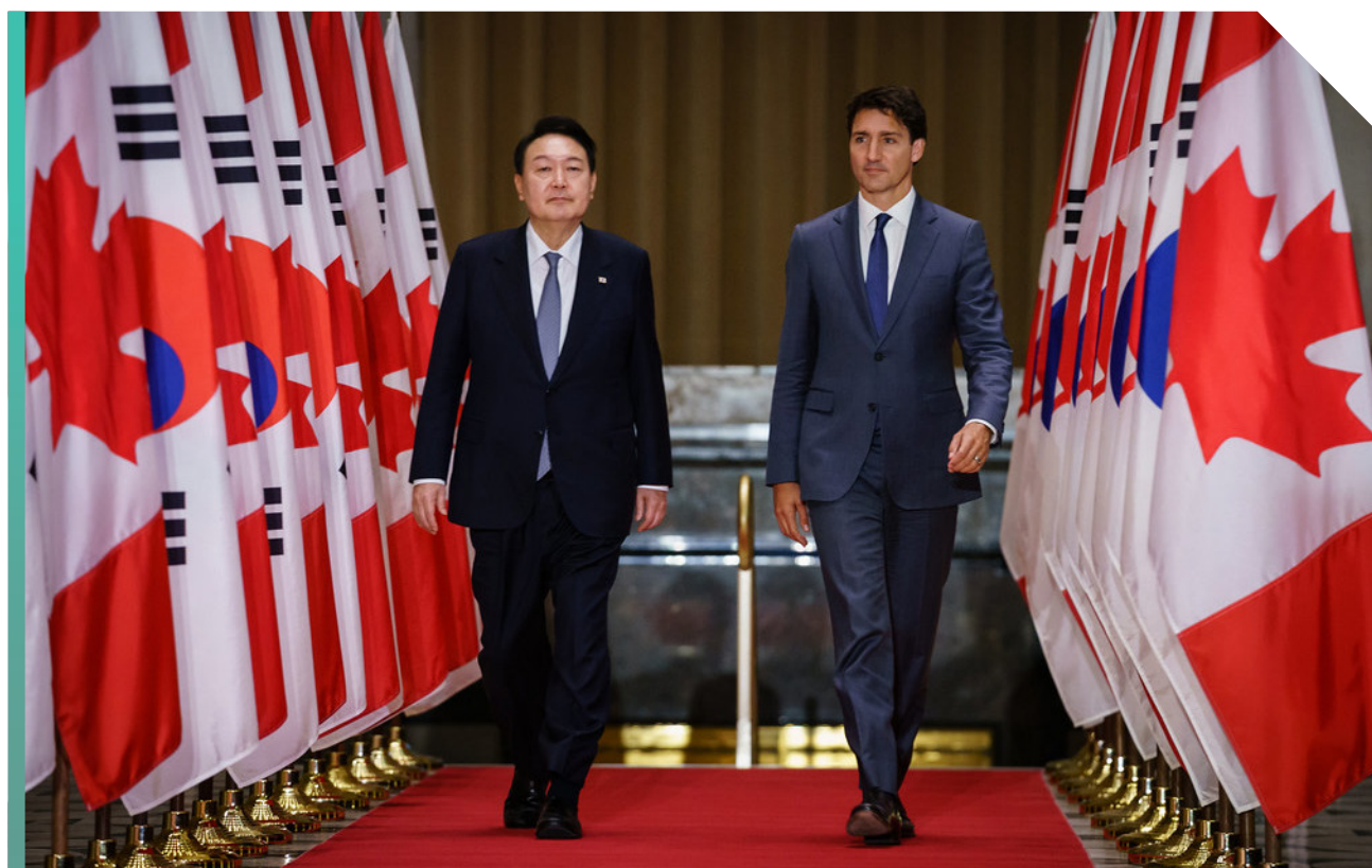
Prime Minister Justin Trudeau meeting Republic of Korea's President, Yoon Suk Yeol, September 2022