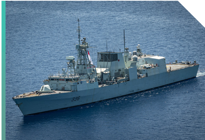
RCN ship HMCS Montréal was deployed to the Indo-Pacific in 2023