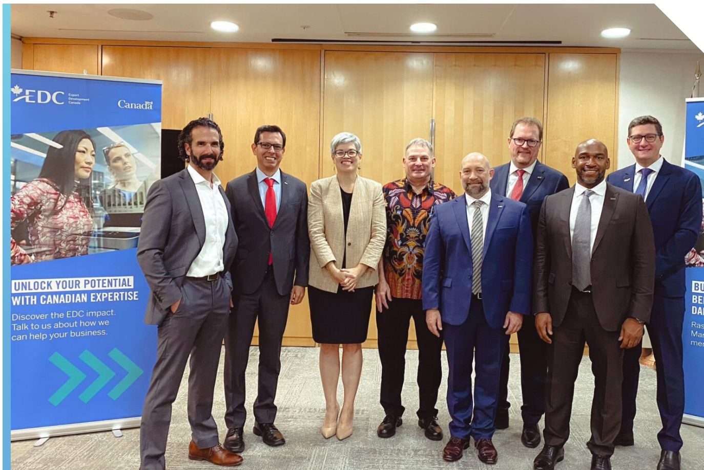
Opening of EDC office in Indonesia, September 2023