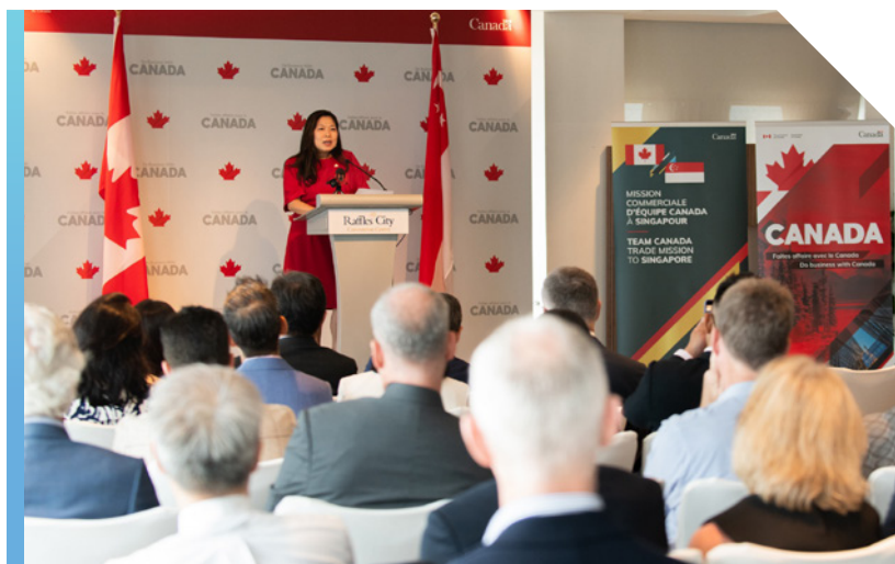
Minister Ng launching Team Canada trade missions in Singapore, February 2023