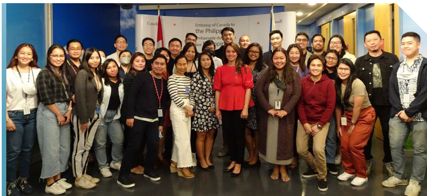
Opening of IRCC's Global Operations Centre, the Philippines