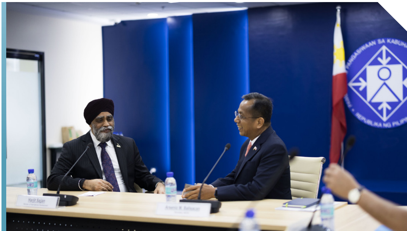
Minister Sajjan's visit to the Philippines, March 2023