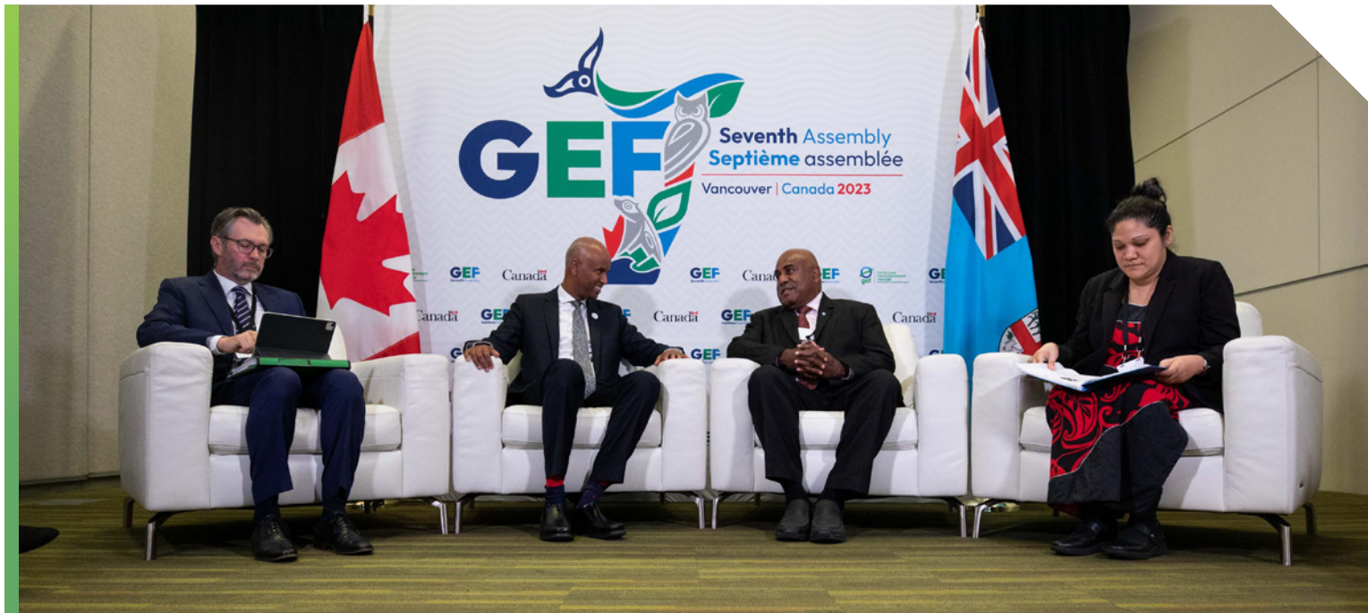
Current International Development Minister Ahmed Hussen at the Global Environment Facility Assembly in Vancouver, 2023