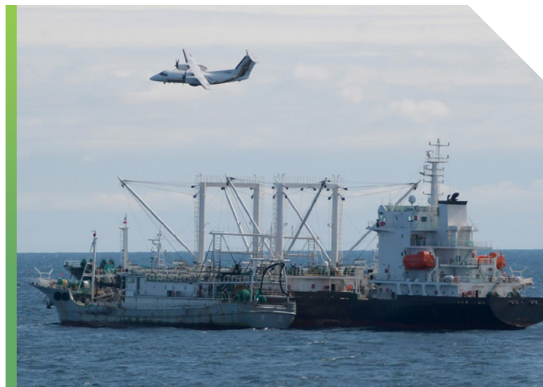
First patrolling mission against IUU fishing in the Indo-Pacific